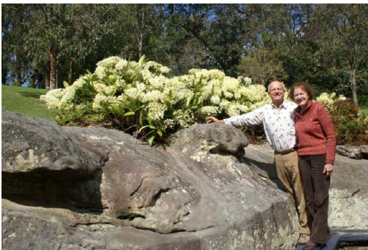
The Orchid Snoops pose by a Dendrobium speciosum , also known as the Sydney Rock Lily.

member exactly where. Like telepathy, the bats swarmed and pushed us up the hill ( we ran! ) to a large rock just covered with the ' Sydney Rock Lily, ' as the sign clearly shows. This is no lily! It was a huge Dendrobium speciosum in full bloom with thousands of cream to white flowers. Actually, it is a common native orchid found on the cliffs and rocky areas all over New South Wales. Several varietal forms exist and this one was the most common, var. speciosum . The pseudobulbs are large and tough with thick, leathery leaves. The plant goes dormant during the hot summer