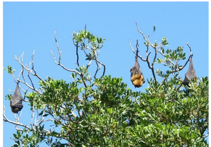
Close-up of fruit bats Sydney Botanical Garden. They are sometimes called 'flying foxes.'

Nevertheless, we found ourselves walking in the beautiful Sydney Botanical Gardens, a huge park along Sydney harbor, enjoying all the