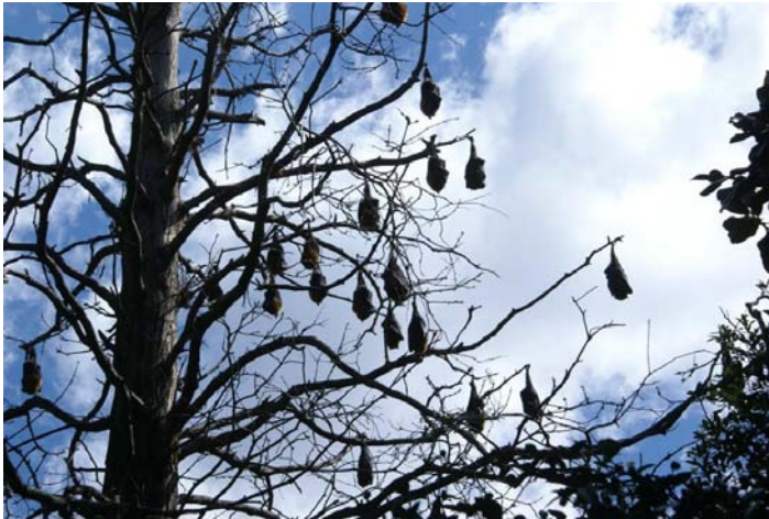
Fruit bats hanging around high up in the trees of the Sydney Botanical Garden.

spring blooming trees and flowers. An eerie feeling crept over us; we wanted to button our collars — not just because of the cool breeze! Swish, flap, flap, flap, squeak — something had us in their radar! Looking up we saw the resident fruit bats high in the trees — hundreds — with huge, 3-foot wing spans! They function as excellent night-time security to keep vagrants off the grounds!