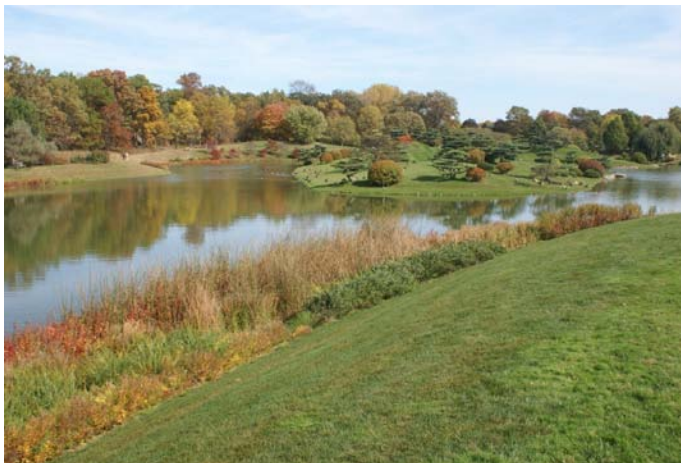
A lovely autumn day at the Glencoe Botanical Center. See page 2 for photos from the Illinois Fall Mini Show!

A small group of people with a big love of growing orchids.