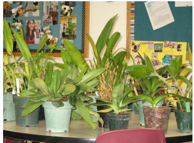
Two whole tables full of excellent plants were available for sale at the quarter auction.