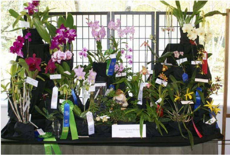
The EIOS display at the Illinois Fall Mini-show at the Chicago Botanical Gardens Oct. 8 - 10, 2010 won the AOS Trophy!